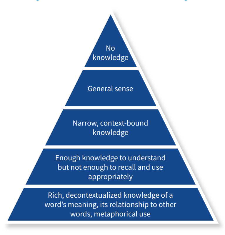
Figure 1. Five Levels of Word Knowledge

(Adapted from Beck, McKeown, & Kucan, 2013)